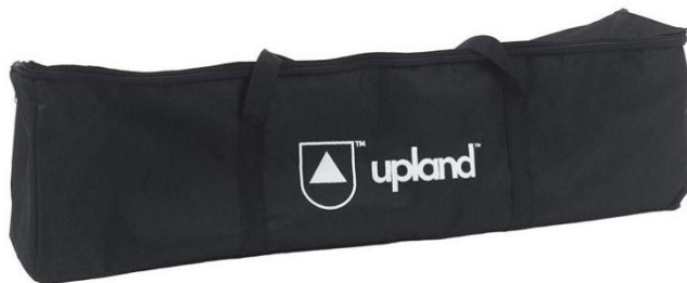
Carrying Bag X 1 pcs