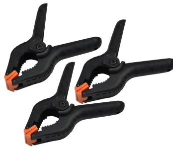
Clamp X 3 pcs