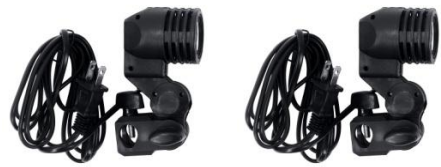
Light Holder X 2 pcs