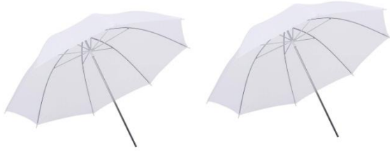
Umbrella X 2 pcs