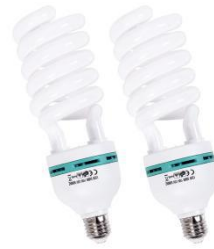
Light Bulb X 2 pcs