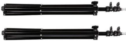
Light Stand X 2 pcs