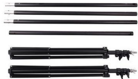
Backdrop Stand X 1 pc