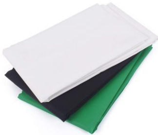
Backdrop X 3 pcs